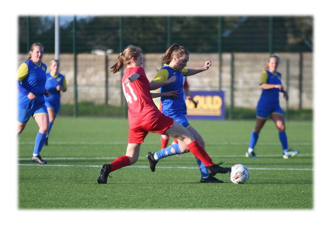
Action from last week's win at Poole