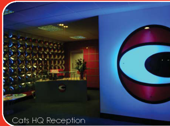
Cats HQ Reception

COLOUR DIGITAL COLOUR DIGITAL COLOUR B&W COPYING B&W COPYING B&W C 24x7 PRINT 24x7 PRINT 24x7 PRINT 2 EB ORDERING ONLINE WEB ORDERING ONLI OLUTIONS DIGITAL SOLUTIONS CE 24x7 SERVICE 24x7 SERVICE 24x7 SERVICE RS WE SELL XEROX COPIERS & PRINTERS WE S